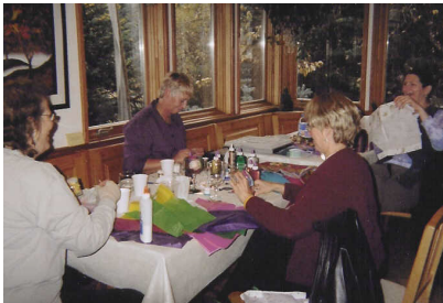
Enjoying crafts at a Women LISTEN retreat.

~ We became a 501(c)3 non-profit organization in September 2004.