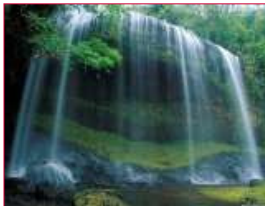
Women LISTEN retreats Renew the spirit and Refresh the body

The group size is limited to fifteen women and space is reserved on a first come, first serve basis. After April 15th, please call for availability.