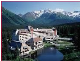
Women LISTEN retreats Renew the spirit and Refresh the body

The group size is limited to ten women and space is reserved on a first come, first serve basis. Rooms at the Hotel Alyeska are double occupancy, furnished with two double beds. After September 1st, please call for availability.