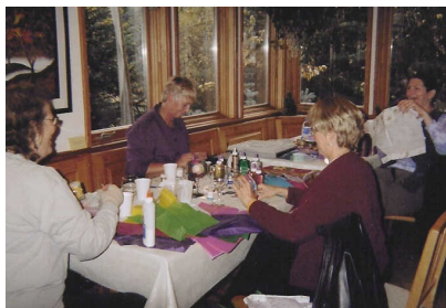
Enjoying crafts at a Women LISTEN retreat.

~ We became a 501(c)3 non-profit organization in September 2004.